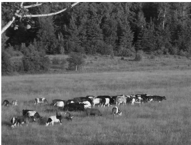
Figure 2. In the northern Great Lakes region of the United States, farm pastures are relatively small, confined grazing systems surrounded by forest. Livestock protection dogs can be fairly easily integrated into this type of grazing system.

Worldwide, there is some variation in how LPDs have been applied by producers relative to geography, the producer’s husbandry practices, and grazing situations. For example, in Sweden and the Great Lakes region of the United States, LPDs are often used in fenced pastures (figure 2; Levin 2005, Gehring et al. 2006, VerCauteren et al. 2008).