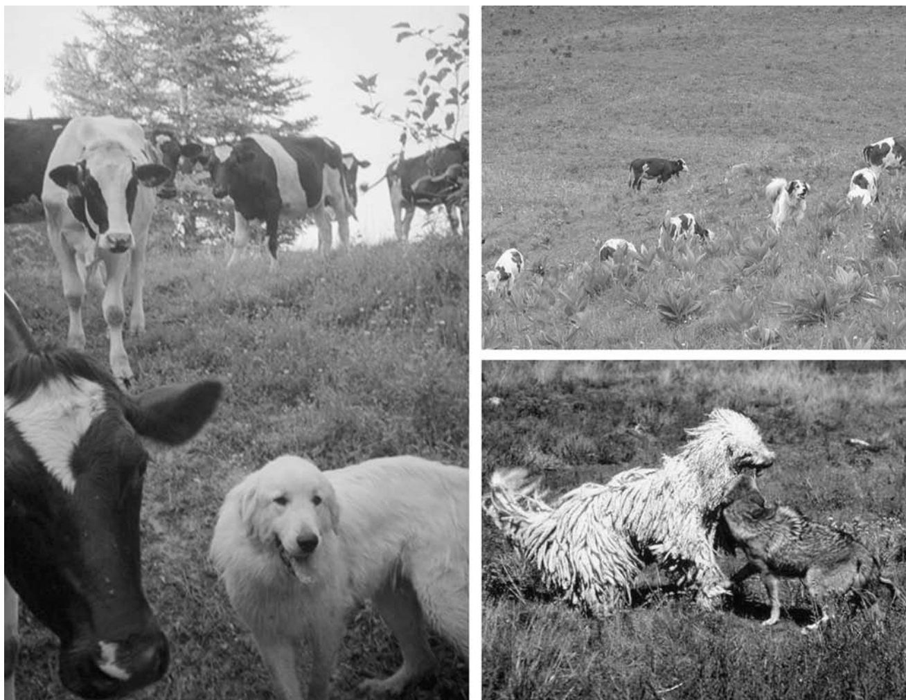
Figure 4. Effective livestock protection dogs display trustworthy, attentive, and protective behaviors.

protecting sheep and goats signify the approach's apparent effectiveness. Past reviews (e.g., Smith et al. 2000) and our research suggest that LPDs are established as effective protectors of sheep from coyotes. The broad application of LPDs for protecting livestock (including cattle) from wolves or wildlife-transmitted disease is much more tenuous and is a rich area for additional research. More rigorous research is needed to definitively assess the effectiveness of LPDs in preventing livestock depredations from wolves or reducing the risk of livestock contracting zoonotic diseases. Past studies of LPDs have been based mostly on surveys of producer attitudes relative to the effectiveness of dogs for reducing predation. Although these data are valuable, there remains a need for more science-based studies of the effectiveness of LPDs, sensu using a large-scale experimental design (Breck 2004). The few field studies that have tested the effectiveness of LPDs have had either small sample sizes or no true control (e.g., as in a before-after-control-impact design). In order for LPDs to be recommended more extensively by managers as a nonlethal management tool for reducing livestock losses due to predators (especially wolves) or wildlife