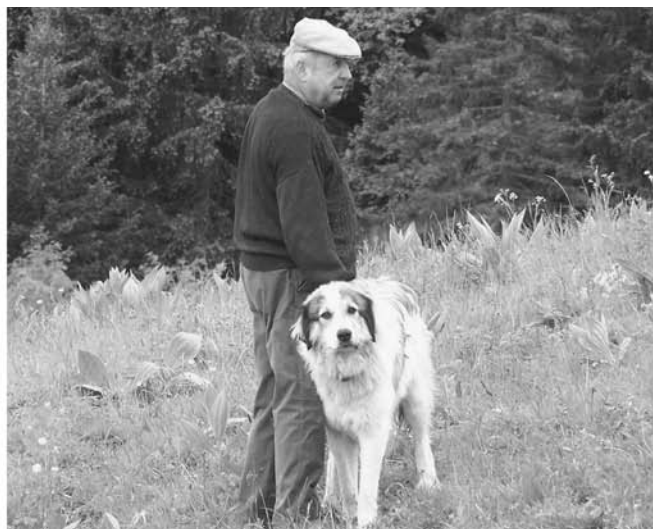
Figure 3. Livestock protection dogs (LPDs) are partners and companions in a producer’s operation. The ability of LPDs to monitor pastures continuously can lead to psychological peace of mind and lower stress for producers.