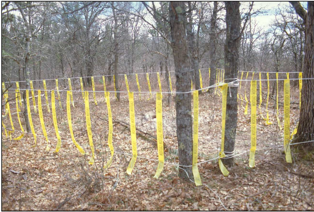
Figure 4. An experimental plot containing a road-killed deer carcass surrounded by a treatment of fladry – a flagging method used to deter wolves (Shivik et al. 2003).

ers trained the owners in verification techniques and issued field kits to improve verification (McManus et al. 2015).