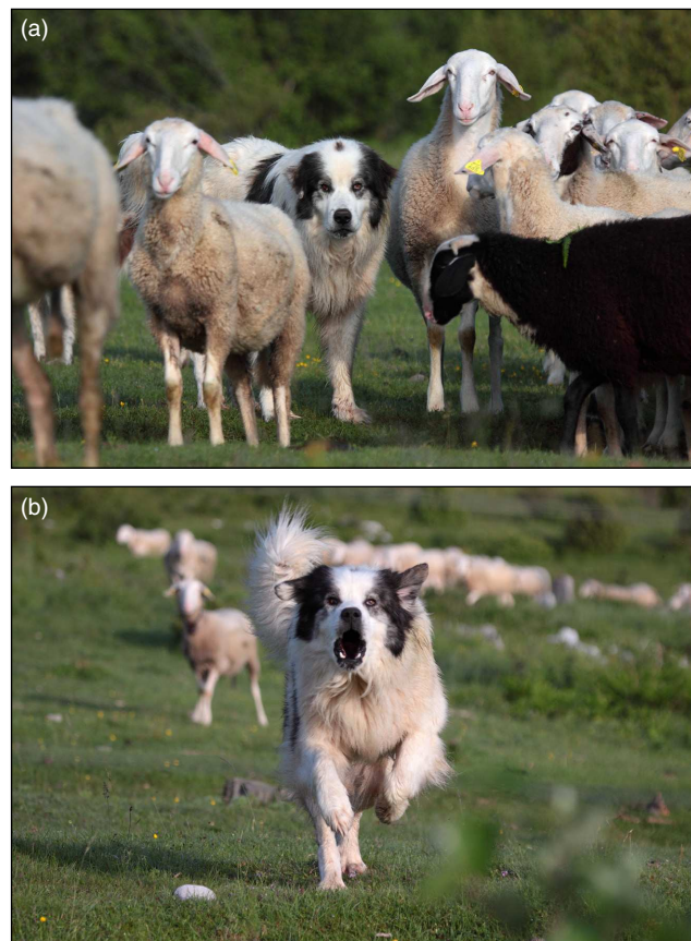
Figure 3. Livestock-guarding dog (a) protecting sheep and (b) charging the approaching photographer.

Tests of effectiveness of interventions to prevent carnivore predation on livestock were consistent across regions. Among 12 North American and European tests that met “gold” or “silver” standards for reliable inference, we found a greater proportion of non-lethal methods were effective in preventing carnivore predation on livestock than lethal methods (80% versus 29%). Quasi-experimental tests of culling and hunting revealed positive, negative, and no effects (Table 1). None of the tests of lethal methods met the gold standard. Indeed, many combined several different methods of killing predators, including unregulated killing that would introduce uncontrolled variables. Culling and hunting appear risky for livestock owners because effects were slight or uncertain and five of seven tests produced no effect or a counterproductive effect (Table 1). This conclusion stands even without the inclusion of four studies that found counterproductive effects of killing wolves, bears, or cougars (Treves et al. 2010;