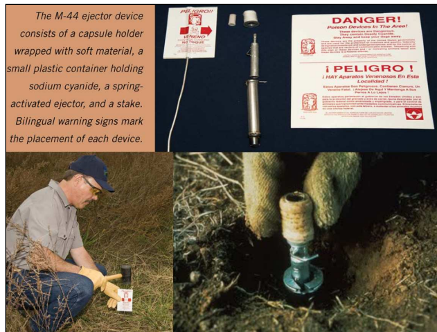
Figure 2. M-44 explosive poison (sodium cyanide) delivery device for killing wildlife (Factsheet May 2010, US Department of Agriculture Wildlife Services; http://1.usa.gov/281v69N ).

considered it in combination with another study to qualify as a BACI design. Cooley et al. 's (2009 a,b) study of cougars ( Puma concolor ) strengthened the inference in Peebles et al. (2013) when looking only at the two-county comparison in the latter paper. Specifically, Cooley et al. (2009 a,b) documented that hunting cougars led to demographic changes in a heavily hunted county and not in another county with much lower rates of cougar hunting (also see White et al. 2011). Later, Peebles et al. (2013) showed that livestock losses rose annually in correlation with the number of cougars taken by hunters but only in the county that experienced changes in cougar demography. We therefore judged that the two studies together provided the causal mechanism and the BACI design needed to identify it as a silver standard test in Table 1.