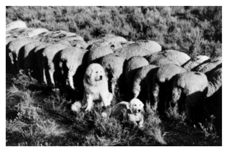
These guarding dogs, a Great Pyrenees and an Akbash dog, stay close to the flock, causing no harm to the sheep but aggressively repelling predators.

Success may be enhanced by viewing a livestock guarding dog as a tool to be incorporated into the overall management of a sheep operation. Dogs do not perform automatically like a piece of machinery, and their behavior is variable. Producers who successfully use a dog may need to slightly alter their management routine to take advantage of the traits of the dog. This may include grazing sheep in different pastures, separating or grouping sheep, moving supplemental feed or sources of water, changing fence design and configuration, or altering schedules of checking the flock.