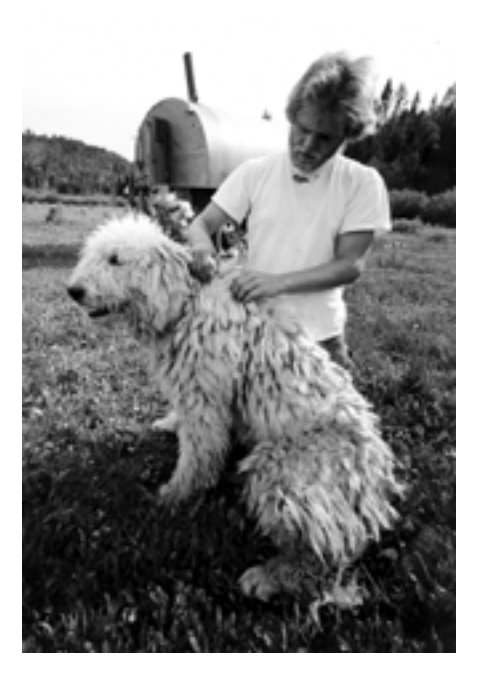
As demonstrated by this dog handler separating mats of hair, the coat of the Komondor requires special care and attention.

Although a guarding dog may provide up to 10 years of productive service, there is a reasonable chance the dog will die prematurely. During a 5-year period of study at the USSES, 32 percent of the working guard dogs died before reaching adulthood. The major causes of death were as follows: hit by vehicle, 23 percent; maliciously