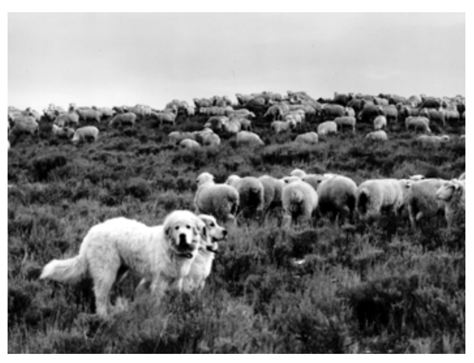
To protect large numbers of sheep on open rangeland or pastures, more than one dog may be required. These two Great Pyrenees guard a large rangeland flock.

More than 80 percent of the people who raise sheep in the United States maintain their flocks in fenced pastures during all or part of the year. This