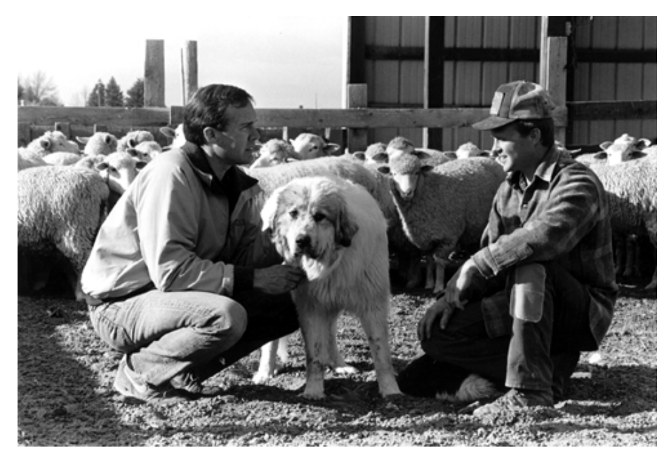
Animal Damage Control Specialists can provide information and quidance to the dog owner.

Dogs may be viewed as a first line of defense against predators in many operations. Their effectiveness can be enhanced by good livestock management and by eliminating persistent depredating predators with suitable removal techniques.