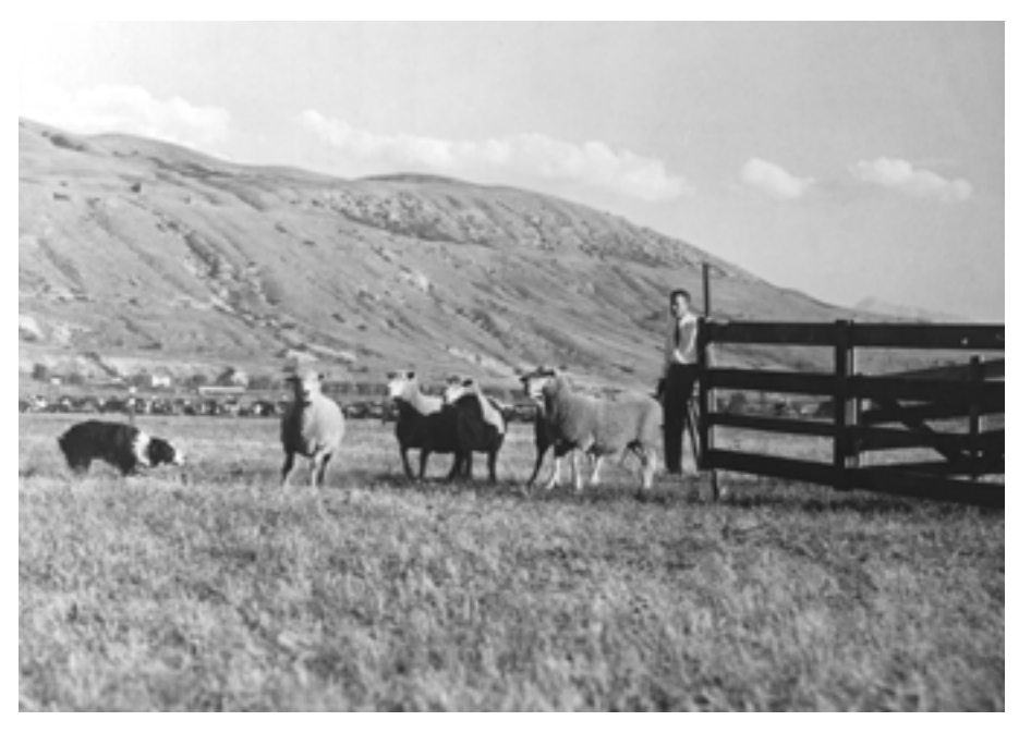
These sheep are responding to the herding actions of this border collie.

Unrestrained nonworking dogs are found on many farms and ranches. These dogs can present a problem to a guarding pup that is being trained to protect the flock. They are a source of distraction and at worst can involve the pup in learning inappropriate behaviors. In some instances a choice has to be made between rearing a good guarding dog and having unrestrained pets.