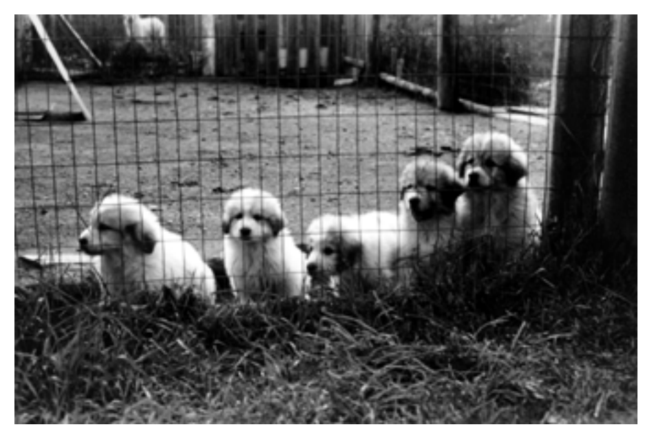
At about 7 to 8 weeks of age, these Great Pyrenees pups will be separated and placed in close contact with sheep so that they will become bonded to them.

of these breeds. Work at the USSES involved the Komondor (Hungary), the Great Pyrenees (France and Spain), and the Akbash (Turkey).