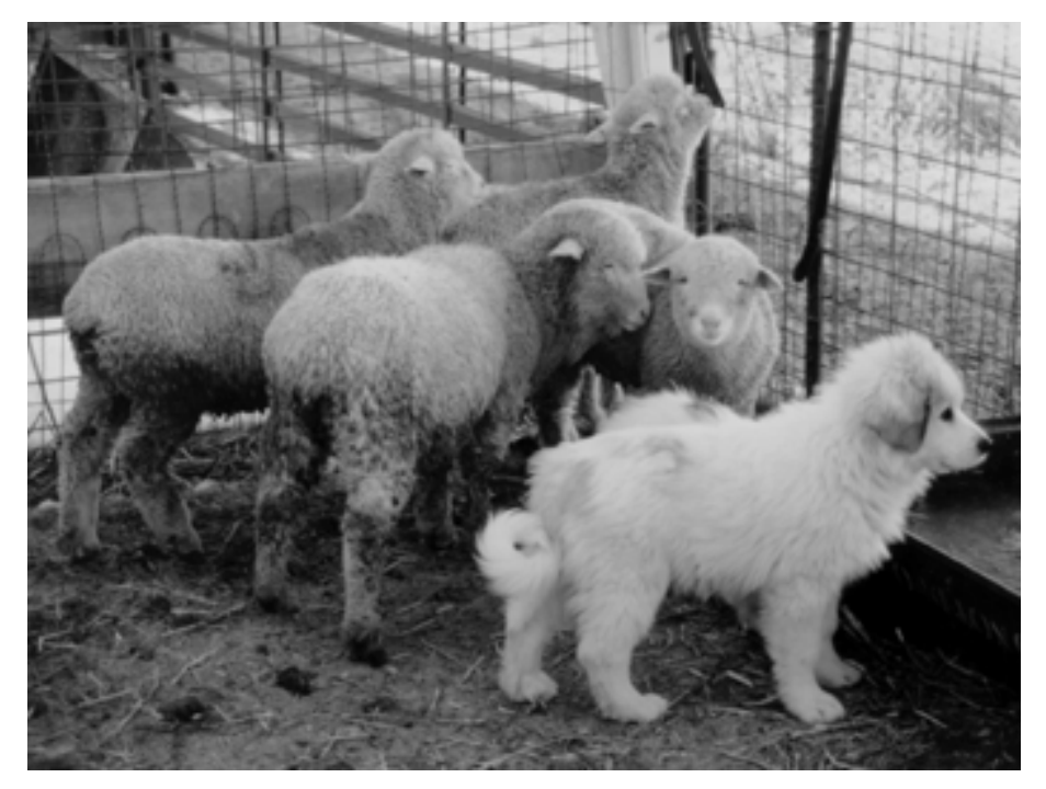
Rearing this Great Pyrenees pup with sheep creates a bond that will be important in determining the dog's future success as a protector.

The ideal place to rear a pup is in a small pen or corral from which it cannot escape. A pup that has been removed recently from littermates and the frequent association of humans may not want to remain in a pen with lambs. If the pup is able to leave its designated area, the inclination of the pup to escape and return to the kennel, home, and people becomes progressively stronger. If the pup is unable to escape, the bond with sheep may develop more easily. Later, as the dog is placed in larger pastures