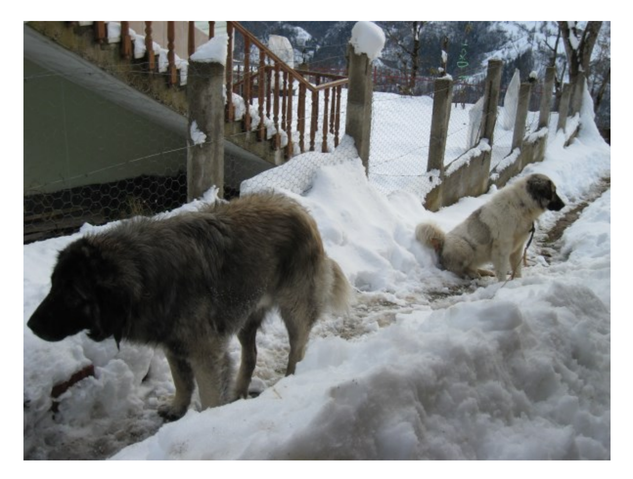
Figure 10. Koyun Dog.

Newly described (Yilmaz and Ertugrul 2012b) from Bayburt, Ordu, Rize, Trabzon Provinces on the eastern shore of the Black Sea in northeast Turkey. The Koyun is a flock and herd guardian dog. The dog is met in various colors, but dark grey is the most common. Bi-coloured animals also occur. Koyun dogs have a solid body structure and strong legs which make for easy traverses of the hilly areas of the Canik Mountains where they are found. The tail is normally pendent but is raised in an alert posture up. Shoulder heights of dogs are about 70 cm and those of bitches about 1-2 cm lower. The Koyun is not a pet and in addition to guardian duties it assists its human owners in giving vociferous or even physical warning of the presence of intruding people or animals (Yılmaz and Ertugrul 2012b, Yilmaz 2014).