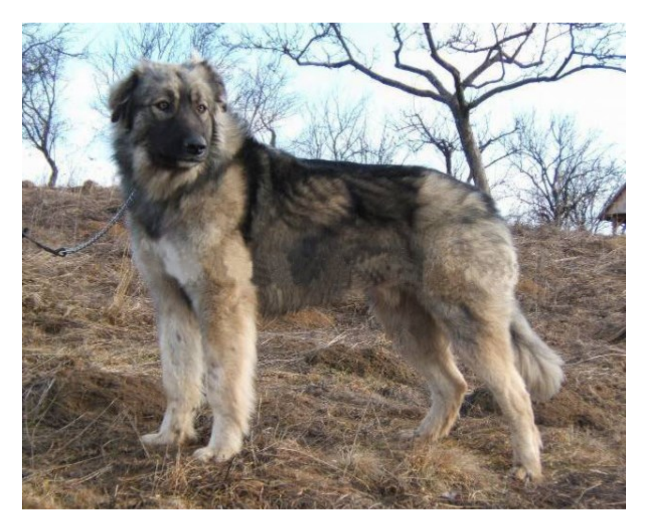
Figure 4. Carpatin Shepherd Dog.

This breed is also called as Romanian Shepherd Dog, Ciobanesc Romanesc Carpatin, Romanian Carpathian Shepherd, Caine Ciobanesc Carpatian, Carpathian Sheepdog, Carpatin, Romanian Carpatin Herder, Rumanian Carpatin.. It is raised in Romania. The main coat colour is white, cream or fawn colour. When they are alert, they erect their tails. This breed is easy temper and stubborn. Some owners put a piece of wood on neck of the dog to prevent the dogs attact to human. Shoulder height is 61-66 cm and adult body weight is about 32-41 kg (Pugnetti 2001, Yılmaz 2006, Yilmaz 2014, Yilmaz et al. 2014).