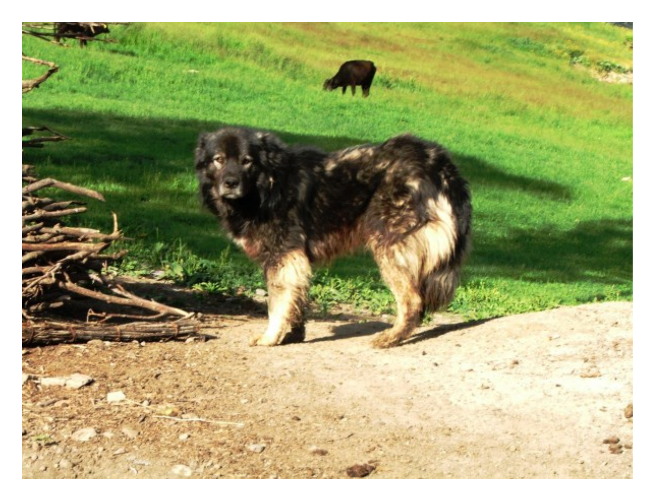
Figure 8. Kars (Caucasian) Shepherd Dog.

It is a regional breed. Kars dog was first defined in 1996 (Nelson and Nelson 1996). It has several alternative local names including 'killi' (shaggy) in Ardahan, Erzurum and Kars Provinces, 'sacakli' (fringed) in Ardahan Province and 'tuylu' (hairy) in Artvin Povince (Yilmaz 2008) and these localities are its main areas of distribution but it also extends to Agri, Erzurum and Igdir Provinces (Yılmaz and Ertugrul 2012a). Kars resembles the Caucasian Ovcharka (Mountain Dog). Its coat exhibits many colours and patterns. Colours include black, reddish brown, agouti, grey, mixtures of black and brown, white, piebald and white with grey patches. White markings are very common in otherwise solid colour dogs. Also common are white forequarters, chests and neck collars. The head is usually dark. The usually long coat is important under severe winter conditions but when it is shed it gives the dog a dishevelled motley appearance. The hairs on the neck and the back of the hindquarters are long and this mane makes it appear larger from the front. The Kars is a somewhat smaller dog than either the Kangal or the Akbash with a mean weight of 44.6 kg and a mean height at the shoulder of 72.4 cm (Kirmizibayrak 2004). In general, the Kars is a "one-man dog" but it an ideal courageous and faithful guard dog (Yilmaz 2006, 2007a, 2007b, 2008).