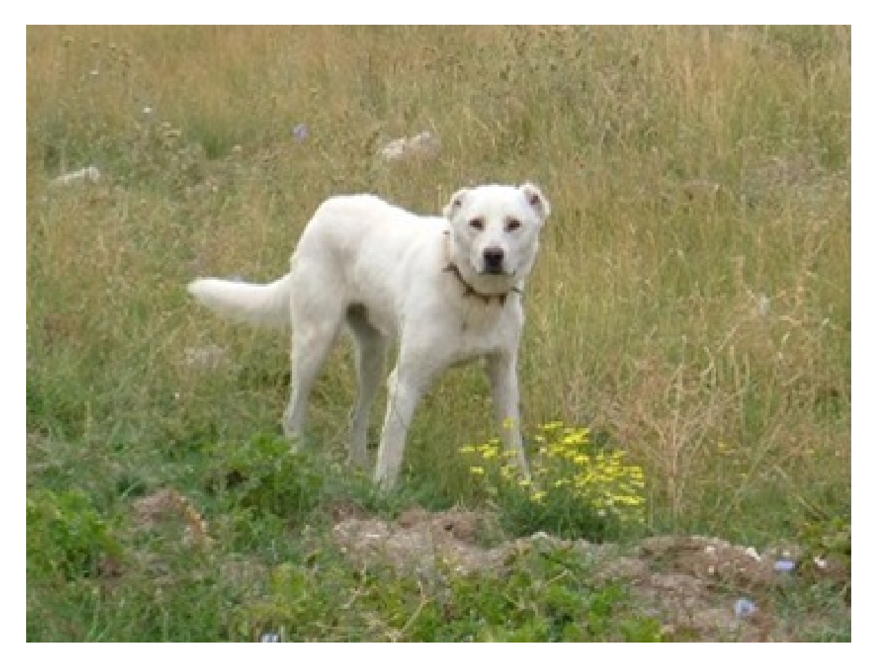
Figure 1. Akbash Shepherd Dog.

The Akbash Dog is a milky white livestock guardian breed native to the plains and mountains of the region between Eskişehir, Afyon, Konya, Salt Lake and Ankara of Turkey, which is its main spread. Even as the origins of the breed are unclear, it is known to be an ancient purebred and originated possibly from Middle Asia. In Turkey Akbash Dogs are owned and