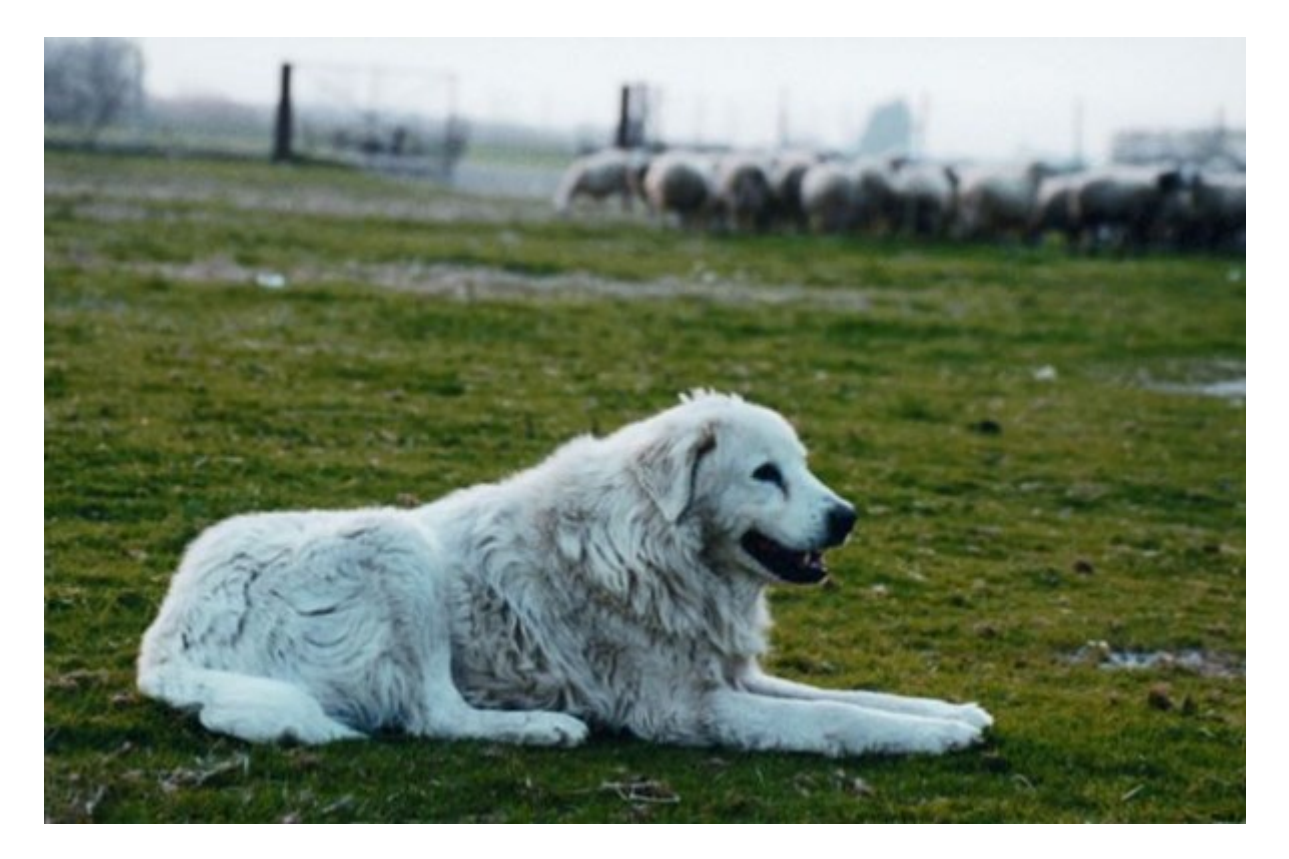
Figure 5. Greek Shepherd Dog.

This breed is raised in Greece and called as Greek Sheepdog, Ellinikos Poimenikos, Hellenikos Poimenikos, Greek Shepherd, and Standard Greek Sheepdog. It is raised in almost all regions of northern Greece. They resemble to Italian Maremma and Hungarian Kuvasz dogs. It is believed that this breed originally come from ancient Greek Civilizations. Coat colour is black, white, brown, light brown or spotted. Spotted dogs are mostly seen. This breed strong and muscled. Hind part of dog is wide and short. Legs are also muscled and strong. Tail is normally pendant but is erected when the dog is alert. Coat has double layer and prevent dogs from cold weather. Hair is longer in rear legs than other parts of body. It is a very successful livestock protection dog and it is also used as property protection. Shoulder height is 70-76 cm for male and 65-70 cm for females. Adult body weight is about 40-50 kg foir male and 30-40 kg for female (Yilmaz 2006, Yilmaz 2014, Yilmaz et al. 2014).