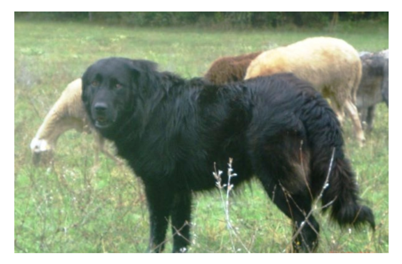
Figure 11. Macedonian Karaman Shepherd Dog.