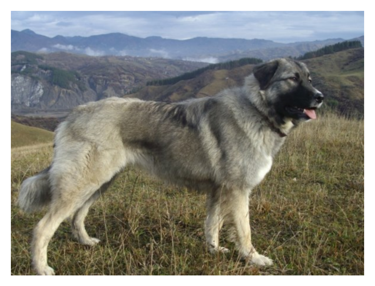
Figure 2. Bucovina Shepherd Dog.

This breed is also called as Romanian Bukovina Sheepdog, Bucovina Sheepdog, Bucovina Shepherd, Southeastern European Shepherd, Dulau, Capau, Ciobanesc Romanesc de Bucovina, Ciobanesc de Bucovina, Bukovina Wolfdog, Bukovinac. Bucovina is raised in Carpatian Mountains in northeast of Romania. The main coat colour is white and the second colour might be brown or black. It has a large and wide head. Jaws are well developed. This breed is easy going, loyal and friendly against ot children. Bucovina is used for protection of large and small ruminant herd and flocks. Shoulder height is 68-78 cm for male and 64-72 cm