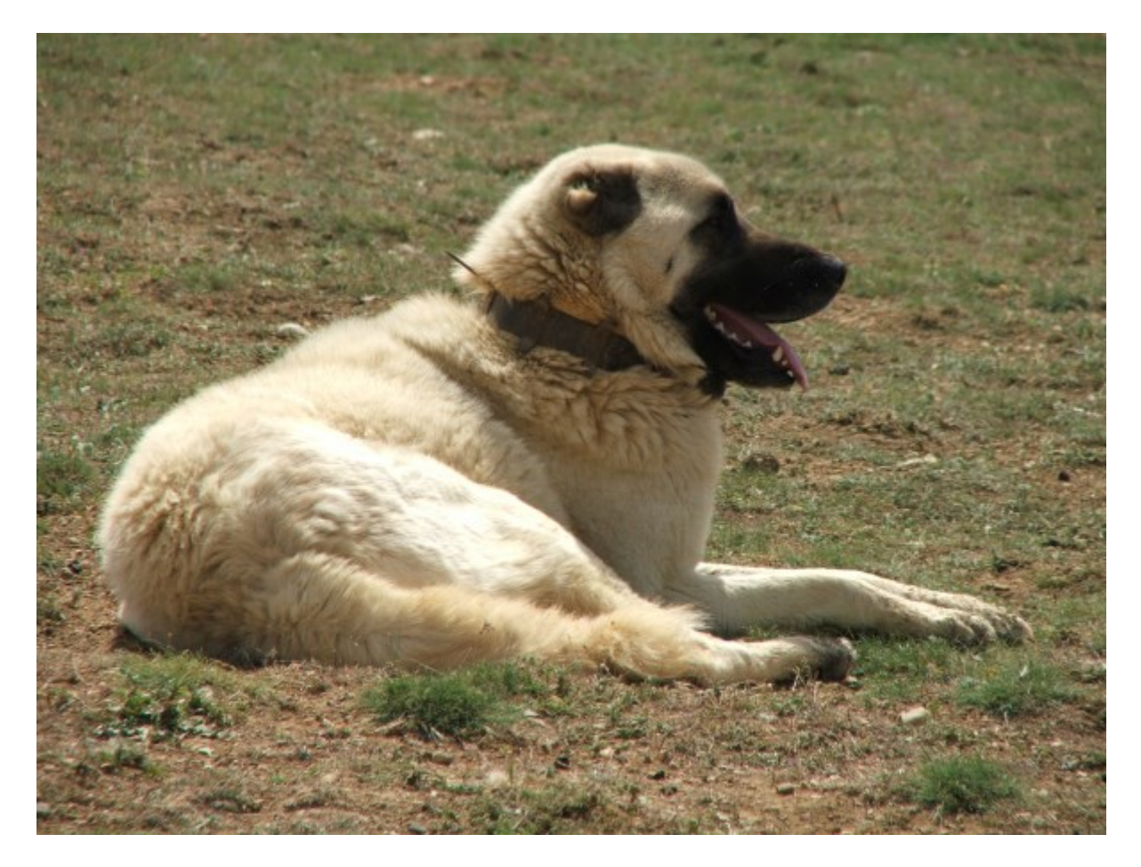
Figure 6. Kangal (Karabash) Shepherd Dog.