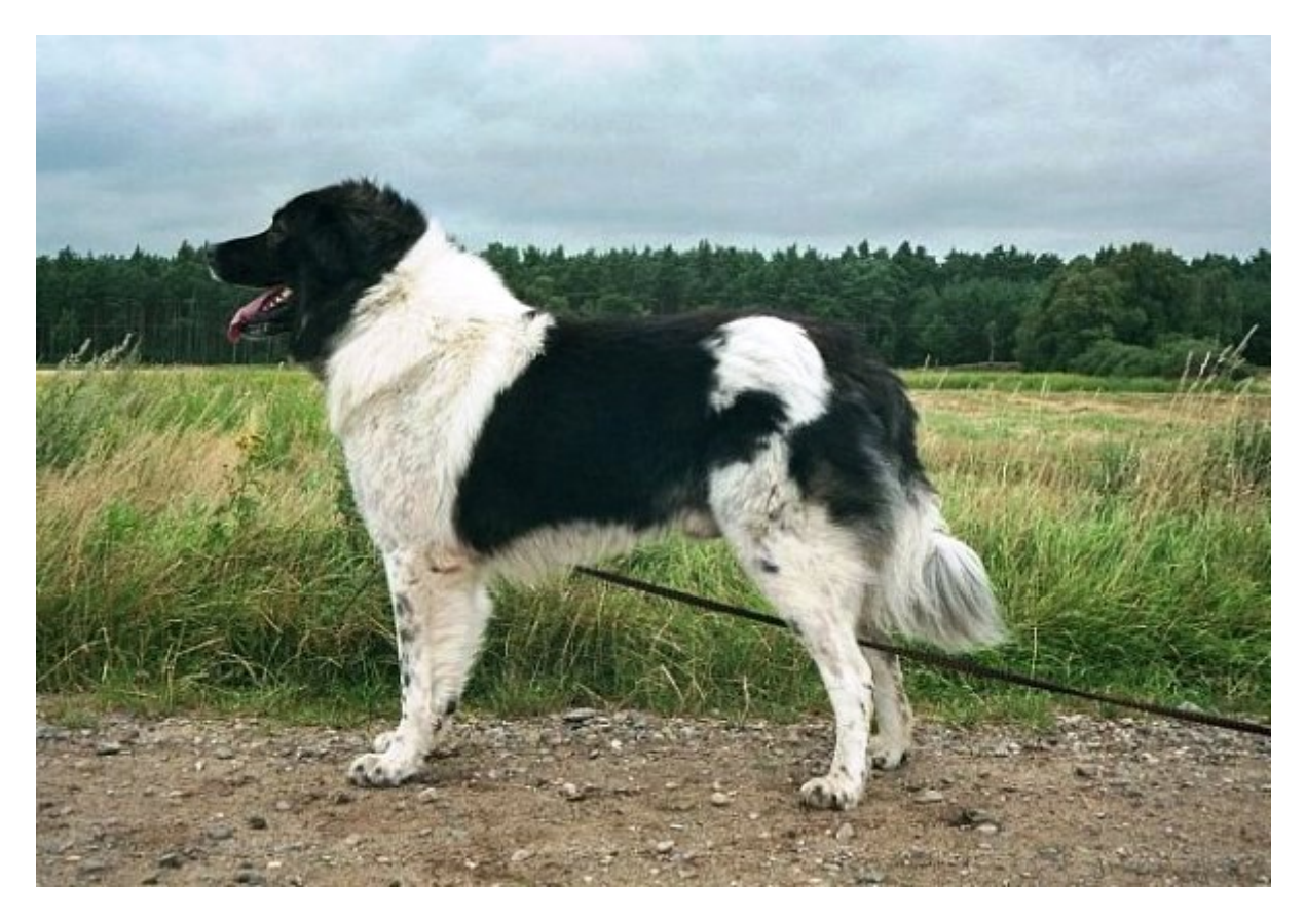
Figure 3. Bulgarian Shepherd Dog.

The Karakachan is a breed of dog that originated in Bulgaria as a mountain livestock guardian dog. Other names are Bulgarian Shepherd and Thracian Mollos. The dog is named after the Karakachans, Balkan Greek nomadic shepherds. Due to their conservative stock-breeding traditions, they have preserved some of the oldest breeds of domestic animals in Europe: the Karakachan sheep, Karakachan horse and the Karakachan dog. The Karakachan dog is one of Europe's oldest breeds. It is a typical Mollos, created for guarding its owner's flock and property; it does not hesitate to fight wolves or bears to defend its owner and his family in case of danger. Its ancestors started forming as early as the third millennium BC (Pugnetti 2001, Sedefchev 2005, Yılmaz 2006, Yilmaz 2014).