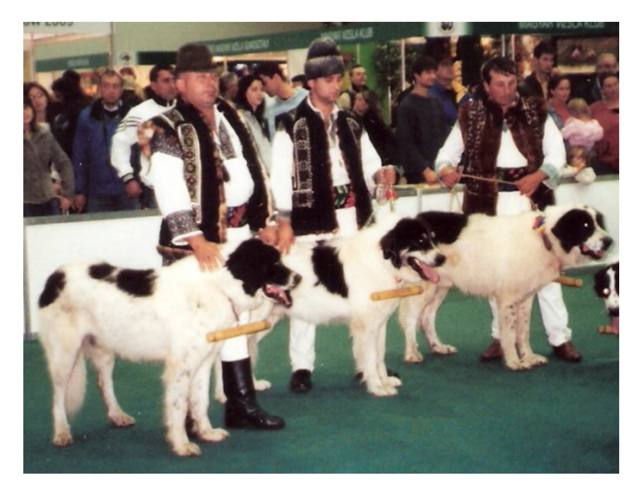
Figure 14. Tornjak Dog.

This breed belongs to Bosnian and Herzegovina and is also called as Bosnian and Herzegovinian Shepherd Dog, Bosnian Shepherd Dog, Croatian Mountain Dog, Bosnian-Herzegovinian and Croatian Shepherd Dog, and Hrvatski Pas Planinac. It is believed that this breed is one the ancient LGD dog breed of the world. A document dated 9<sup>th</sup> century mentioned about Tornjak Dog. Although solid or bicolored are seen, the colour is generally white. It is a large, robust, and square-shaped dog breed. Body parts are well-balanced. It is an even-tempered, gentle, and pleasant natured dog. This breed is very active in case of danger, but it is not too aggressive. Shoulder height is 65-70 cm for male and 60-65 cm for females (Pugnetti 2001, Yılmaz 2006, Yilmaz 2014).