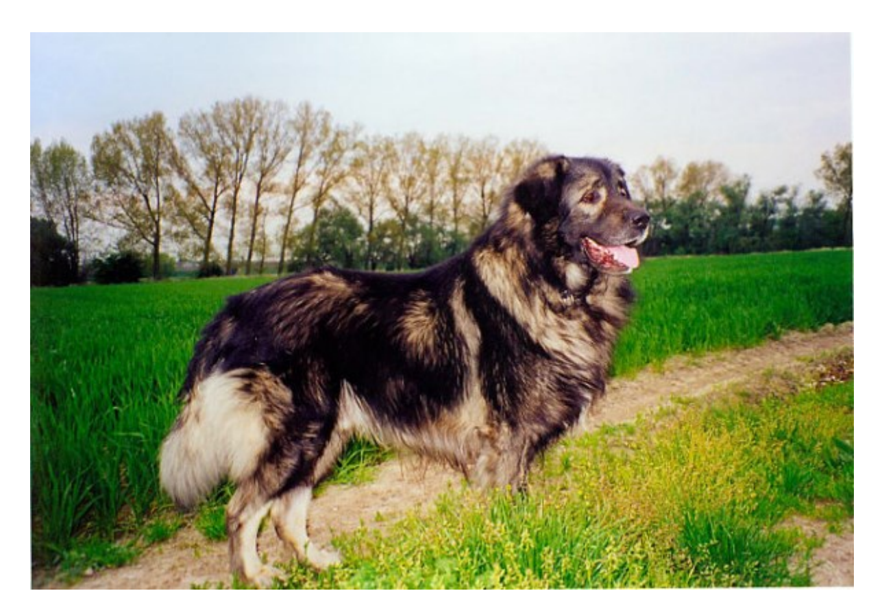
Figure 13. Sharplaninac Dog.