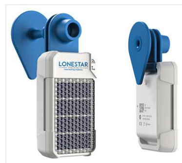
GsatSolar ear tag tracker.