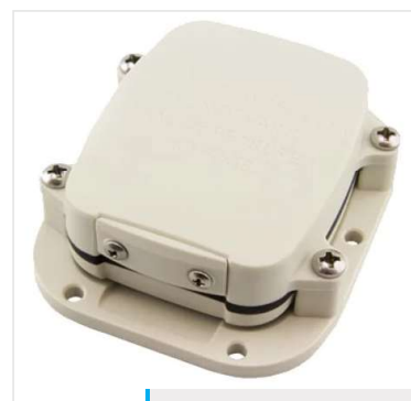
Smart One C satellite-based GPS tracker.

never have to be removed for battery replacement. However, the units currently available are a little too large to be placed on a dog's collar. Also, most of the units need direct sunlight to stay adequately charged to send a signal, which may require a harness on the dog. A new solar-powered ear tag tracker has just come out and is showing good early testing on LGDs. The unit can easily be attached to a dog collar.