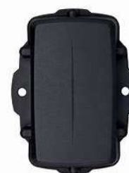
Oyster 3 cellular GPS tracker made by Digital Matters. Picture courtesy of Digital Matters, 2022.

Uploads occur at set times during the day, usually every 2 to 4 hours, and refer to the ping data being sent to the tracking company's computer system. Uploads generally use the most battery life of a GPS tracker. By adjusting the upload time, you can conserve battery life while still being able to see where the dog has been. For example, a 15-minute ping with a 2-hour upload is a good setting to use for young LGDs under 2 years of age, as young dogs tend to roam and test the property boundaries more than older dogs. For dogs over 2 years of age, a 30-minute ping with a 4- to 6-hour upload is a good setting to monitor their daily activity. Mature dogs that are moved often or new to an area may need a more frequent ping and upload time to accurately track their movements to ensure they have not wandered off of the ranch. A geofence is also a good tool to use in the tracker's software to notify you if they have left.