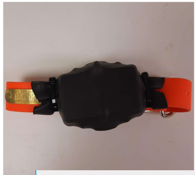
Oyster 3 GPS tracker attached to a 2 inch wide dog collar with electrical heat shrink and 3 zip ties.

GPS trackers can be very helpful in locating LGDs and livestock from your phone or computer and are relatively inexpensive. However, battery life can be an issue, and false geofence alerts can create a lax attitude toward checking the dog's actual location. GPS trackers can be purchased from a variety of providers online. Most companies have a unit cost and monthly fee for the unit's service contract. Prices vary with a unit's abilities and warranty. Producers should research what each company provides and their service contract requirements before purchasing a tracker. GPS trackers, like all technology, are constantly changing and adding new features. Producers should try to purchase the newest units they can so the technology does not become outdated too quickly.